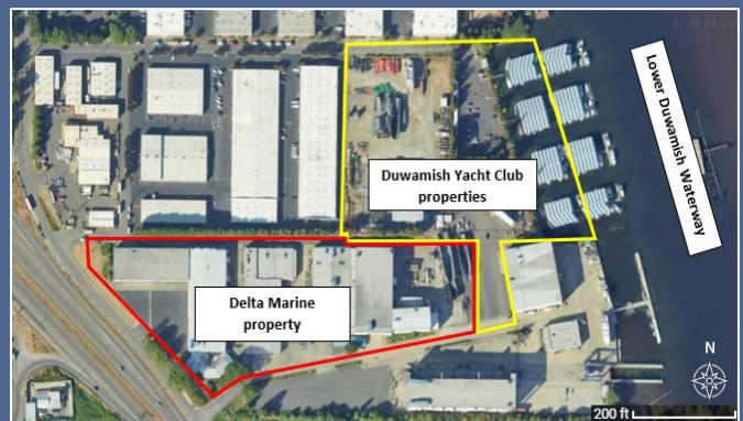
Aerial map of the Delta Marine Industries cleanup site

To request an ADA accommodation, contact Ecology by phone at 425-533-5537, email LDW@ecy.wa.gov , or visit ecology.wa.gov/Accessibility . For Relay Service or TTY call 711 or 877-833-6341.