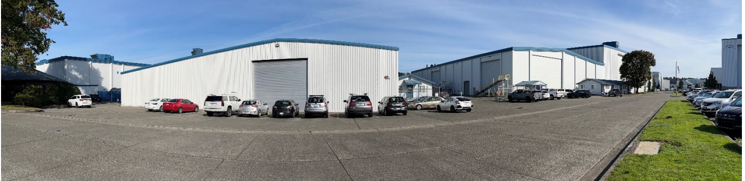
Delta Marine Industries cleanup site location