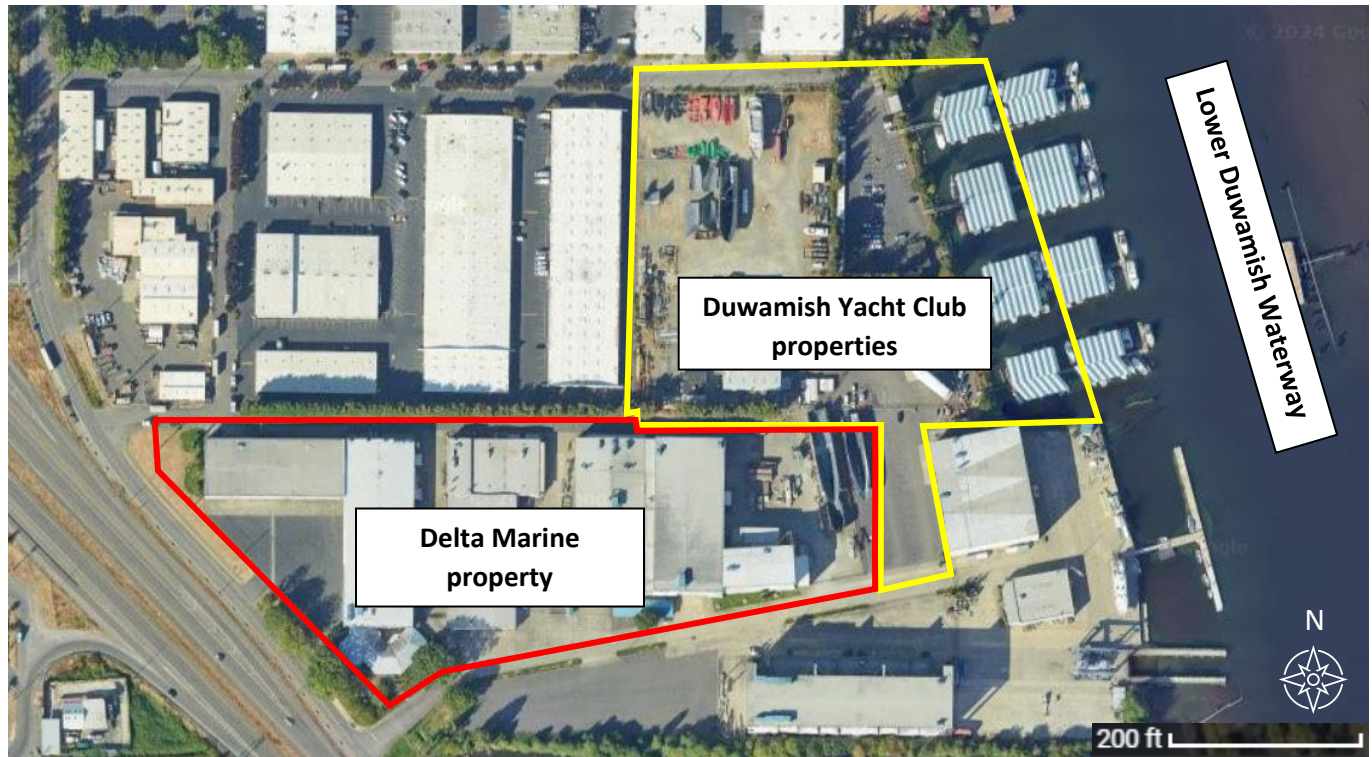
Aerial map of Delta Marine Industries cleanup site