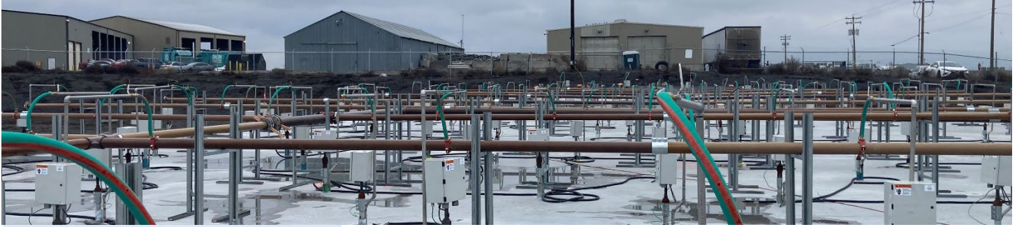
The thermal treatment system for soil contamination in Zone A of the Pasco Landfill.