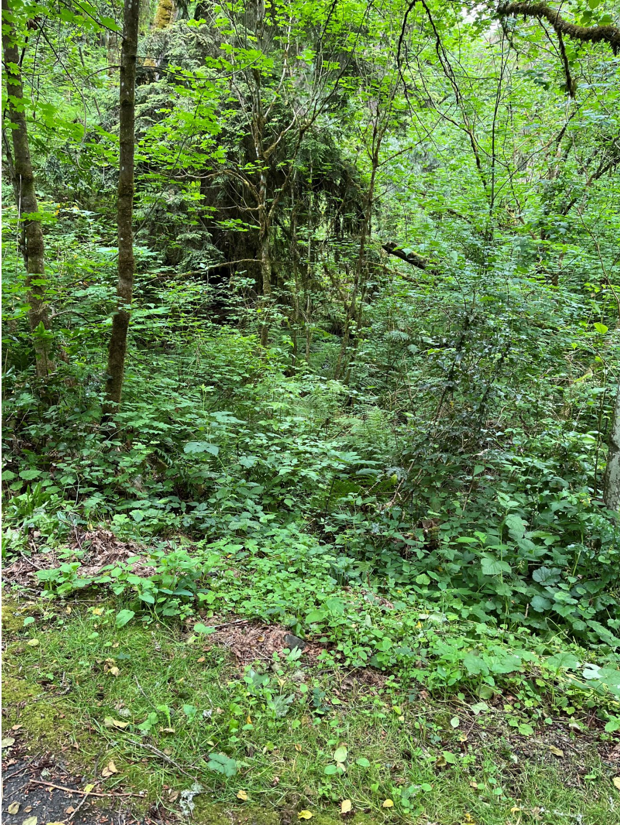
Photo 2. Gun Club Tributary, looking west from footpath. View of the water is obscured by bushes. June 10, 2024.