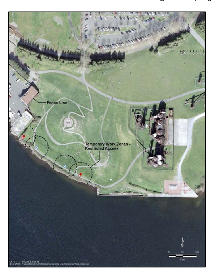
Photo at left showing western shoreline of Gas Works Park with drilling locations and areas to be closed to public access during drilling activities.

Seattle Parks and Recreation will close affected portions of the western shoreline area of Gas Works Park for about two weeks while the drilling crew and environmental scientists conduct the drilling and sampling event.