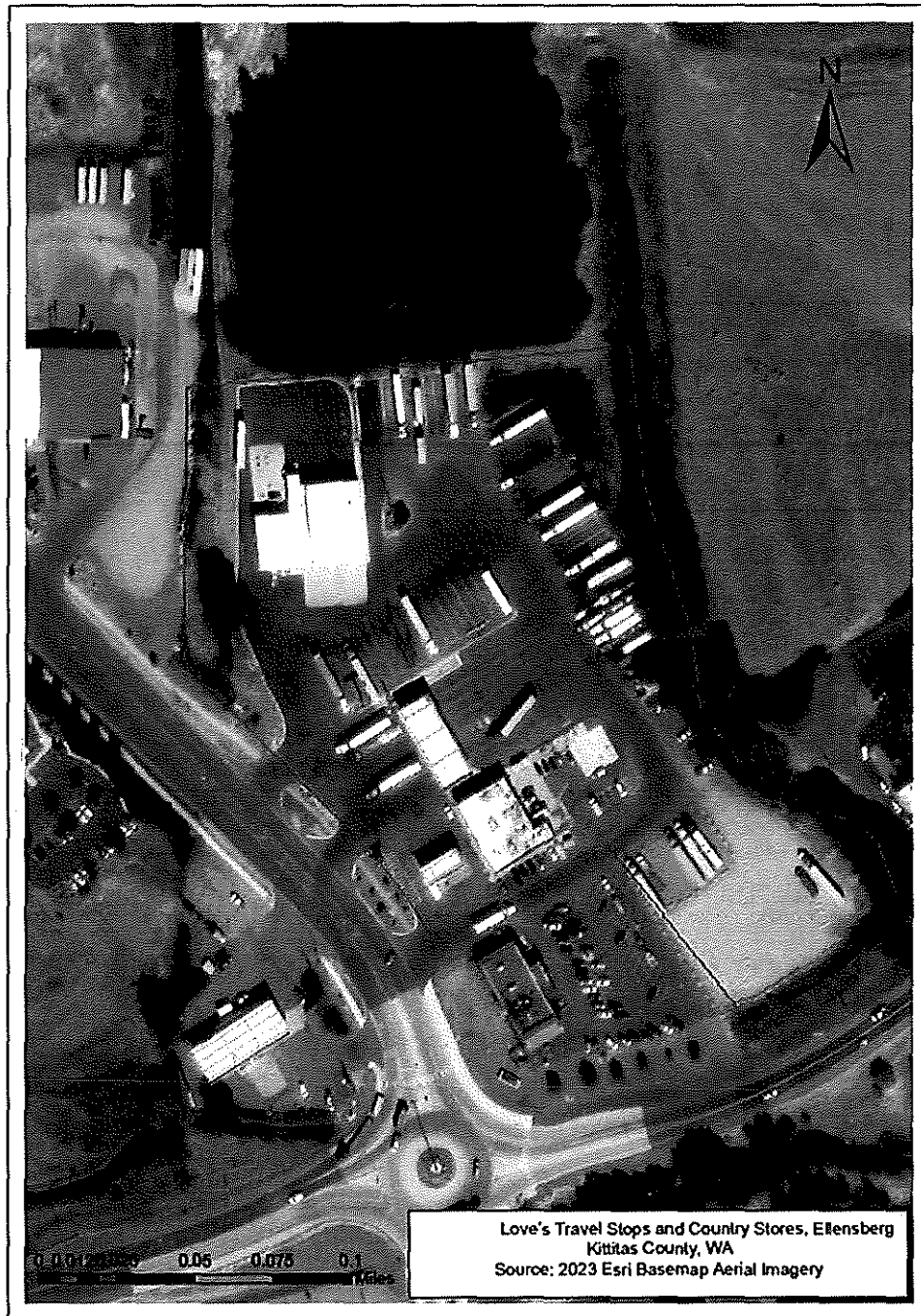
Exhibit A—Site Map