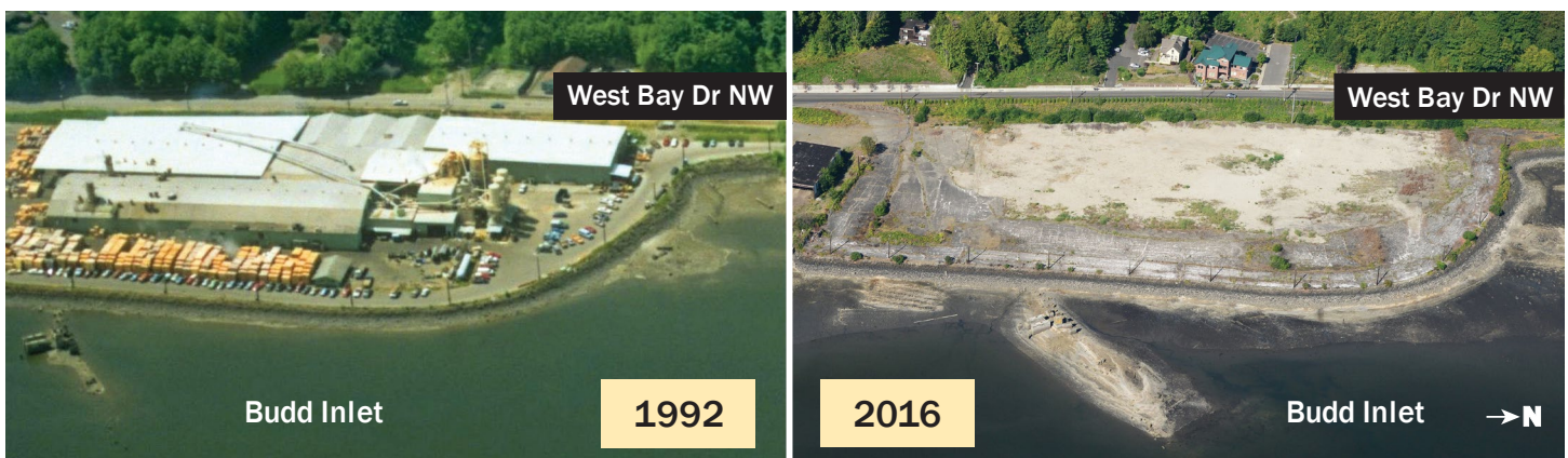
Figure 1. Aerial photos of the cleanup site from May 1992 (left) and July 2016 (right). The site is located off West Bay Dr NW and is on the shore of Budd Inlet. The 1992 photo shows Hardel's manufacturing facility; these buildings were destroyed in the 1996 fire. The 2016 photo shows the current undeveloped condition of the site.

In 2007, Ecology and Hardel signed a legal agreement to start the cleanup process at this site.