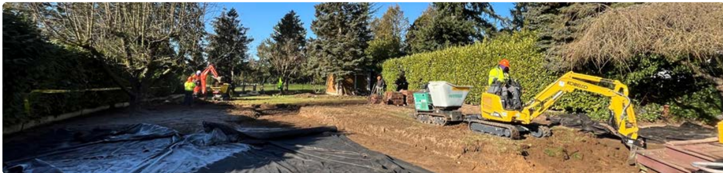
2022 cleanup group construction.