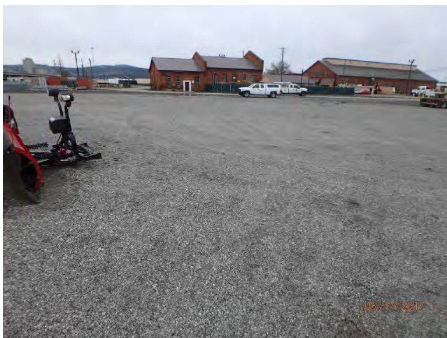
Photograph 4 – Looking to south.