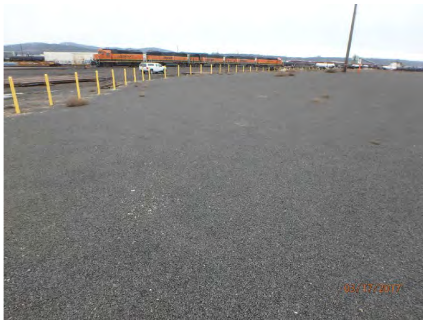
Photograph 3 – Looking to south.

East and West Debris Area 2017 Cap Integrity Monitoring Parkwater Rail Yard Site