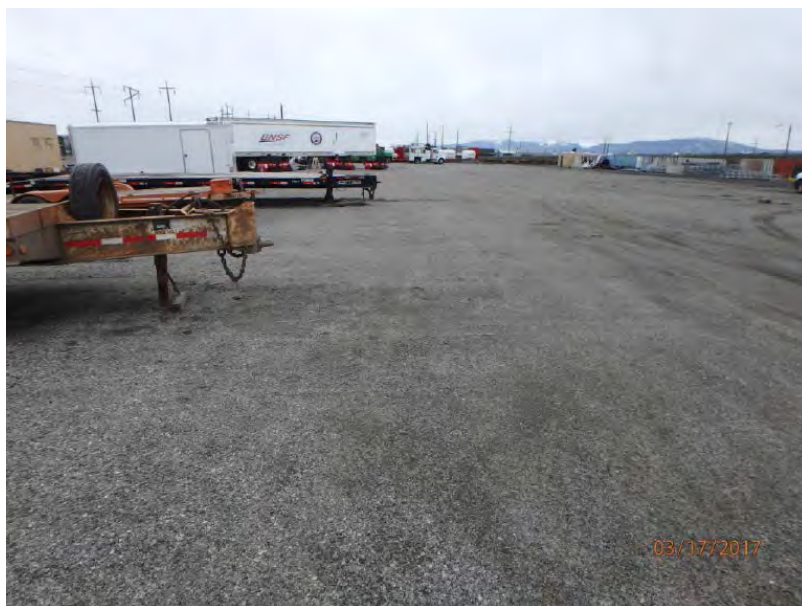
Photograph 2 – Looking to east. Closer to western end.