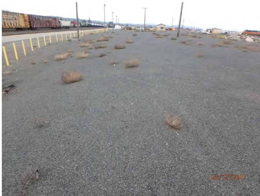
Photograph 4 – Looking to northeast. Standing near southwestern end of cap.