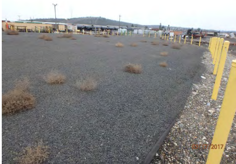
Photograph 2 – Looking to east.