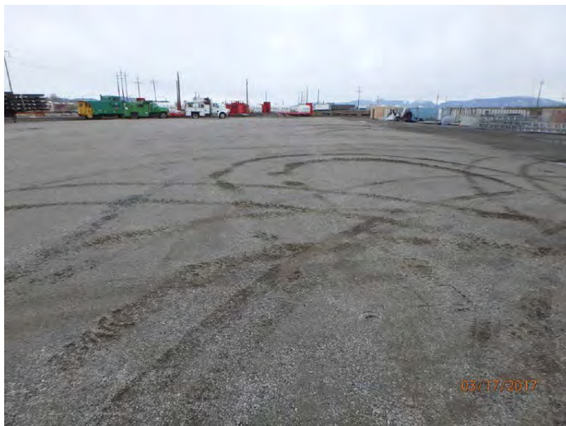
Photograph 1 – Looking to east.

Former Koch Asphalt Lease Area 2017 Cap Integrity Monitoring Parkwater Rail Yard Site