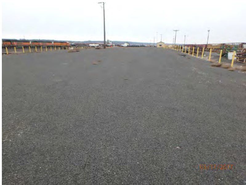
Photograph 1 – Looking to southwest.

East and West Debris Area 2017 Cap Integrity Monitoring Parkwater Rail Yard Site