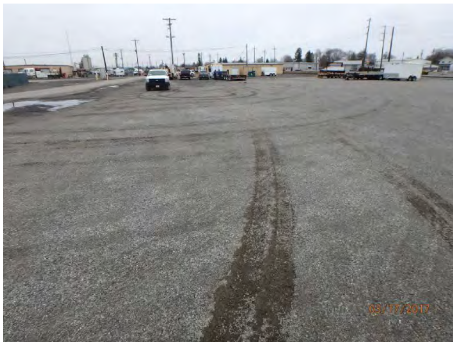
Photograph 3 – Looking to west. Note puddling is off of the cap (between cap and access road).

Former Koch Asphalt Lease Area 2017 Cap Integrity Monitoring Parkwater Rail Yard Site