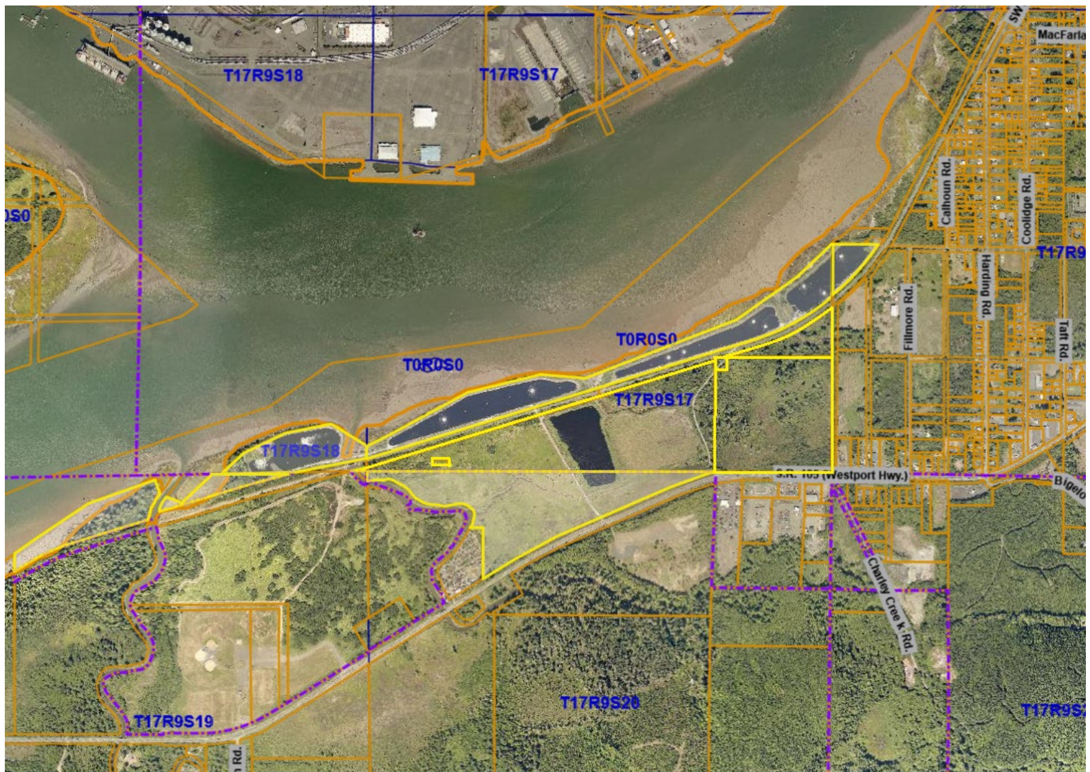
Figure 2. Westport Ponds with Cosmo's Property Boundaries in Yellow