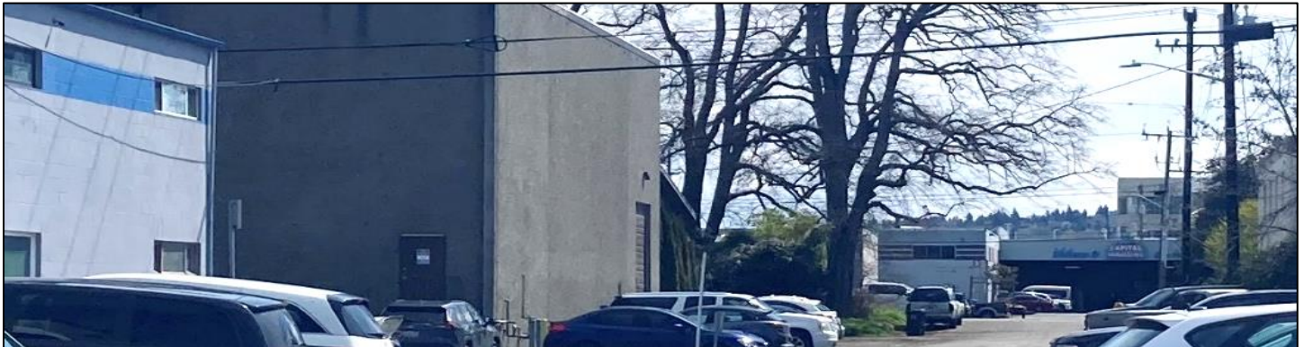
View of Art Brass Plating, Blaser Die Casting, and Capital Industries at the West of 4th site in Georgetown.