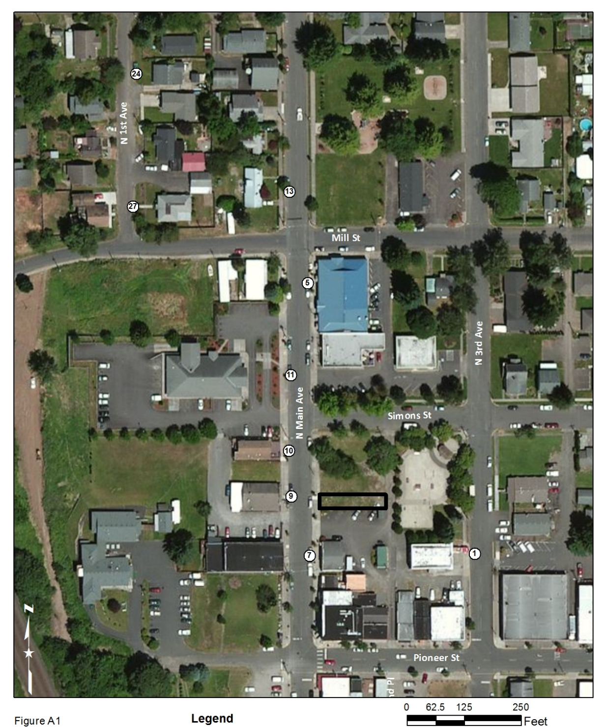
Figure A1 Indoor Air Sampling Locations Park Laundry Site Ridgefield, Washington