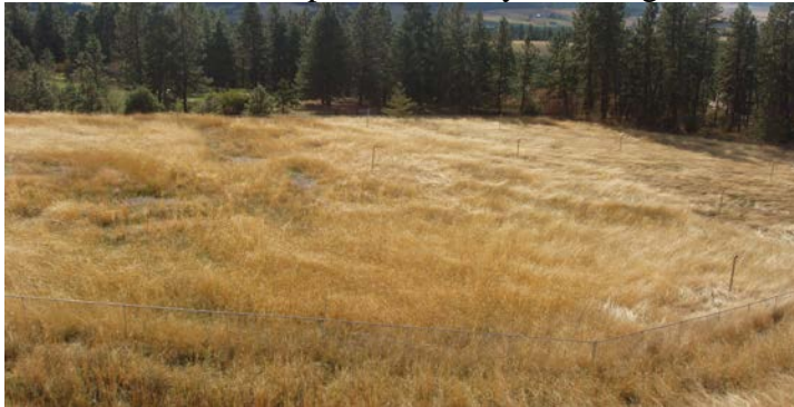
Looking in a westerly direction at the site

The Washington State Department of Ecology and Kaiser Aluminum and Chemical Corporation (now DCO Management) propose to enter into a Consent Decree that will guide cleanup at the Heglar Kronquist site. The site is 10 miles northeast of downtown Spokane in a rural area and covers nearly four acres. It is located near the intersection of Heglar and Kronquist Roads near Mead, Spokane County, Washington.