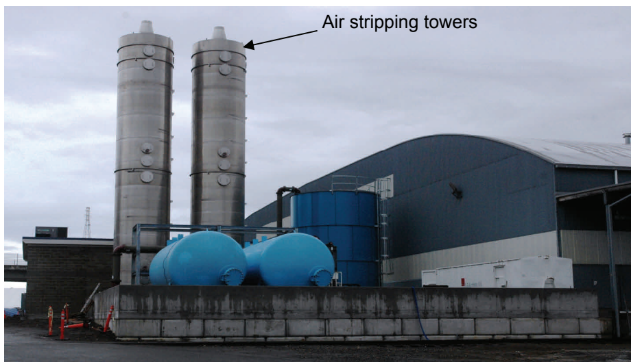
Groundwater pump and treat, and air stripping system

The port began operating a new groundwater pump and treat system in 2009. It removes trichloroethylene (TCE) and other contaminants from groundwater using air stripping. Ecology's website (page 1) has a fact sheet on how the air stripping system works.