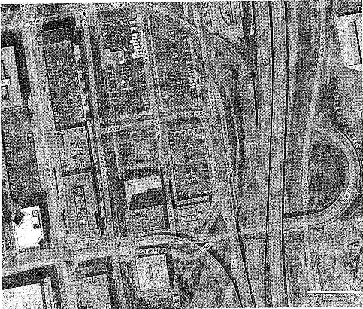
Sauro's Cleanerama, 1401 S. Pacific Avenue, Tacoma