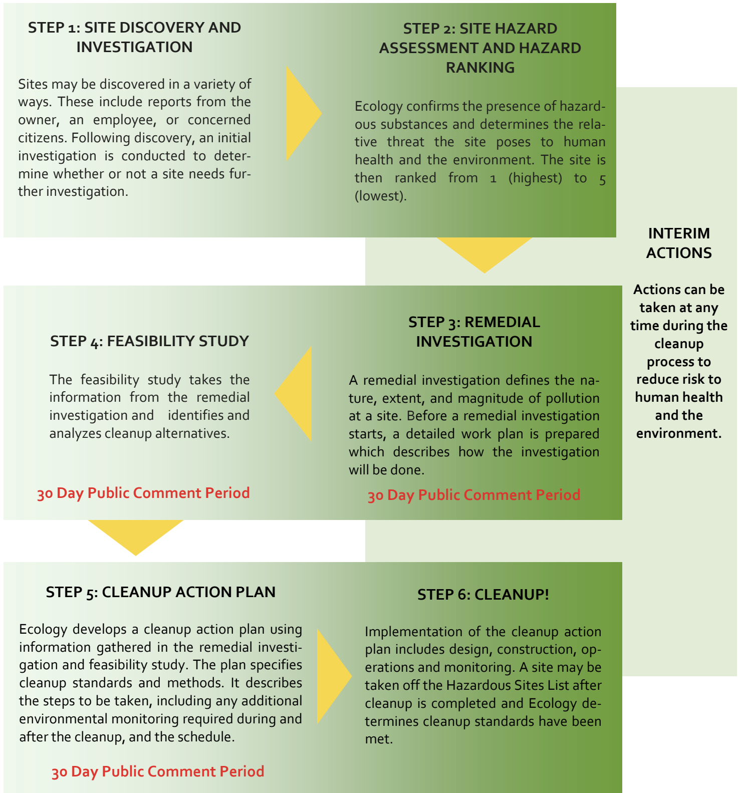
Figure 3. Steps in the Model Toxics Control Act Cleanup Process