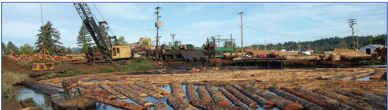
Log pond at the Hambleton Brothers mill site in operation (2009).

Ecology will study and respond to any comments received during the comment period. The port will begin cleanup after the Agreed Order is final.