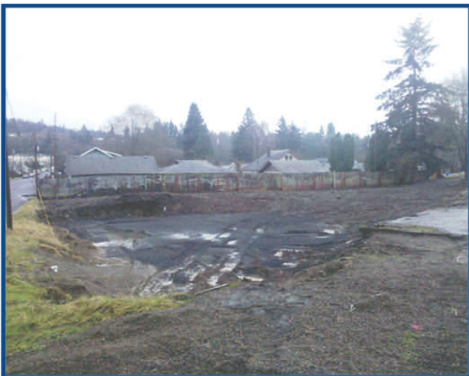
Terry's Salvage site, in 2011

For the 2013-15 period, the city will receive a remedial action grant. This $475,000 grant will help the city pay for cleanup costs.