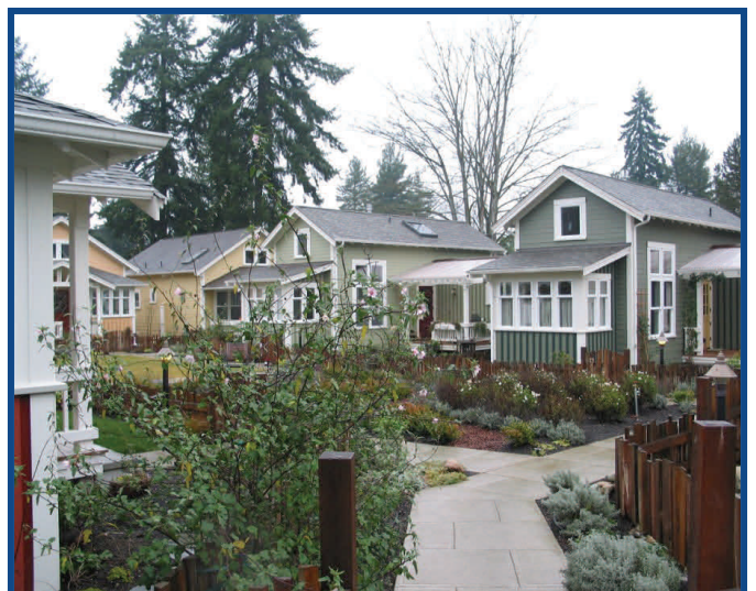
Example of cottage-style housing