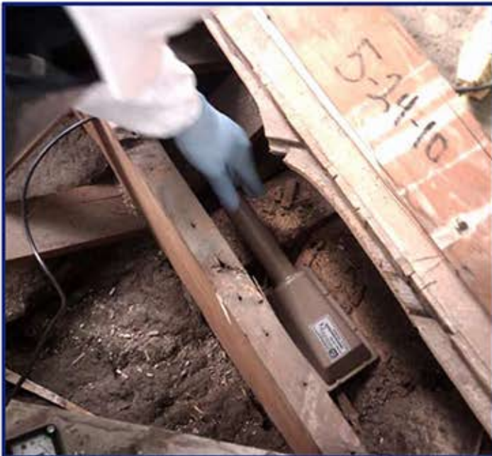
This photo depicts hand monitoring of floor joists after removal of flooring and subflooring.