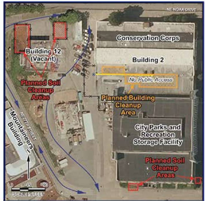
Aerial view of Buildings 2 and 12.