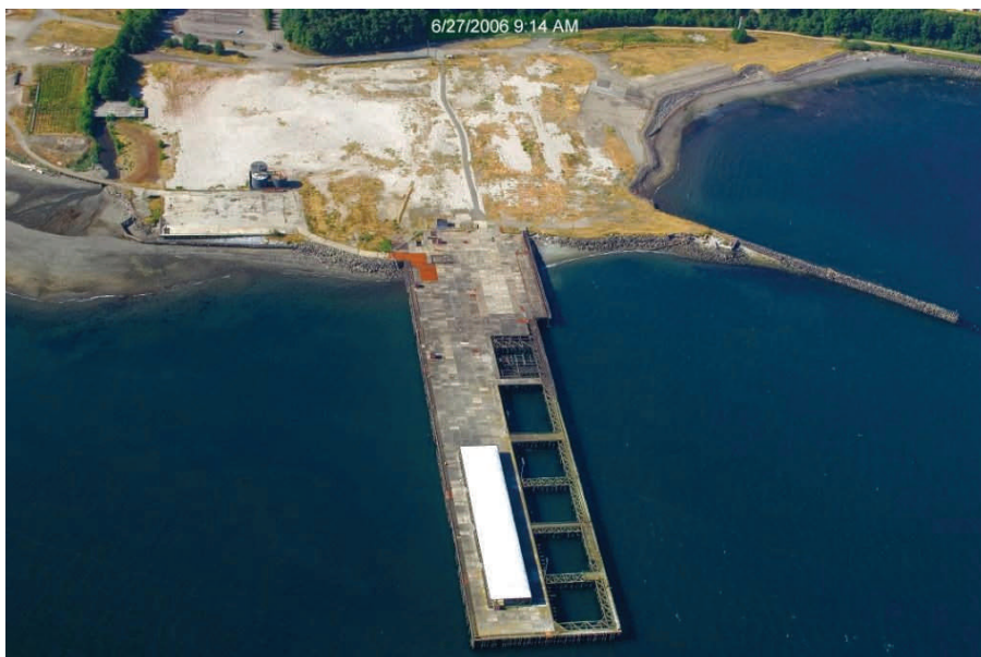
Aerial view of the Rayonier Mill property and dock

Ecology is accepting comments on the Agreed Order and updated Public Participation Plan. Ecology is also asking for public input on removing a restrictive covenant that is no longer needed (see page 4). The box to the right lists where to view these and related documents and how to submit your comments. Please submit comments by March 5, 2010.