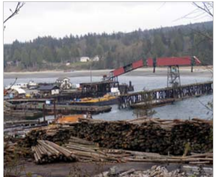
Photo of the Pope & Talbot, Inc. sawmill.