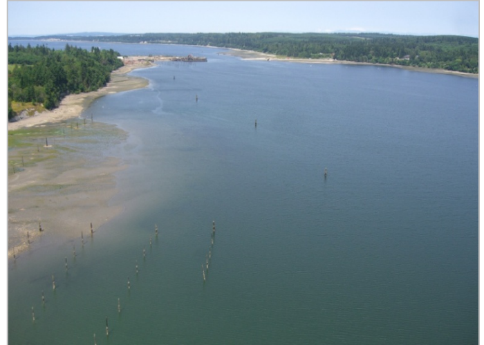
Aerial view of Port Gamble Bay.

We appreciate your comments and concerns. Thank you.