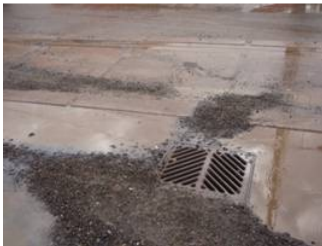
Stormwater runoff entering a storm drain. Runoff can carry soil pollutants like arsenic and lead.

Ecology can also require a permit for a site with pollutants impacting waters of the state. This includes Tacoma Smelter Plume arsenic and lead!