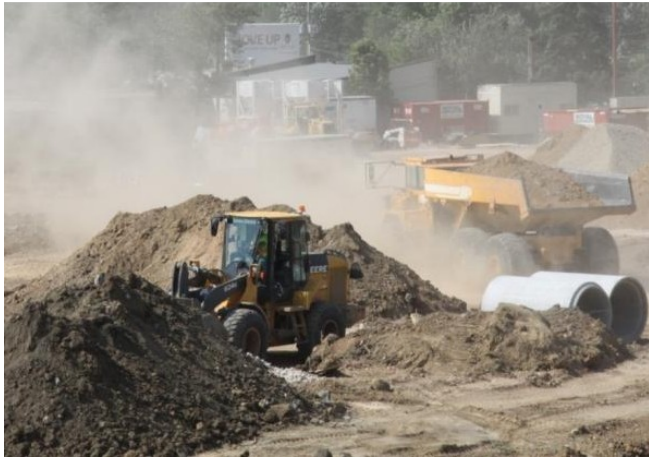
Visible dust on a construction site is against state law. Arsenic and lead in dust can pose a health risk.