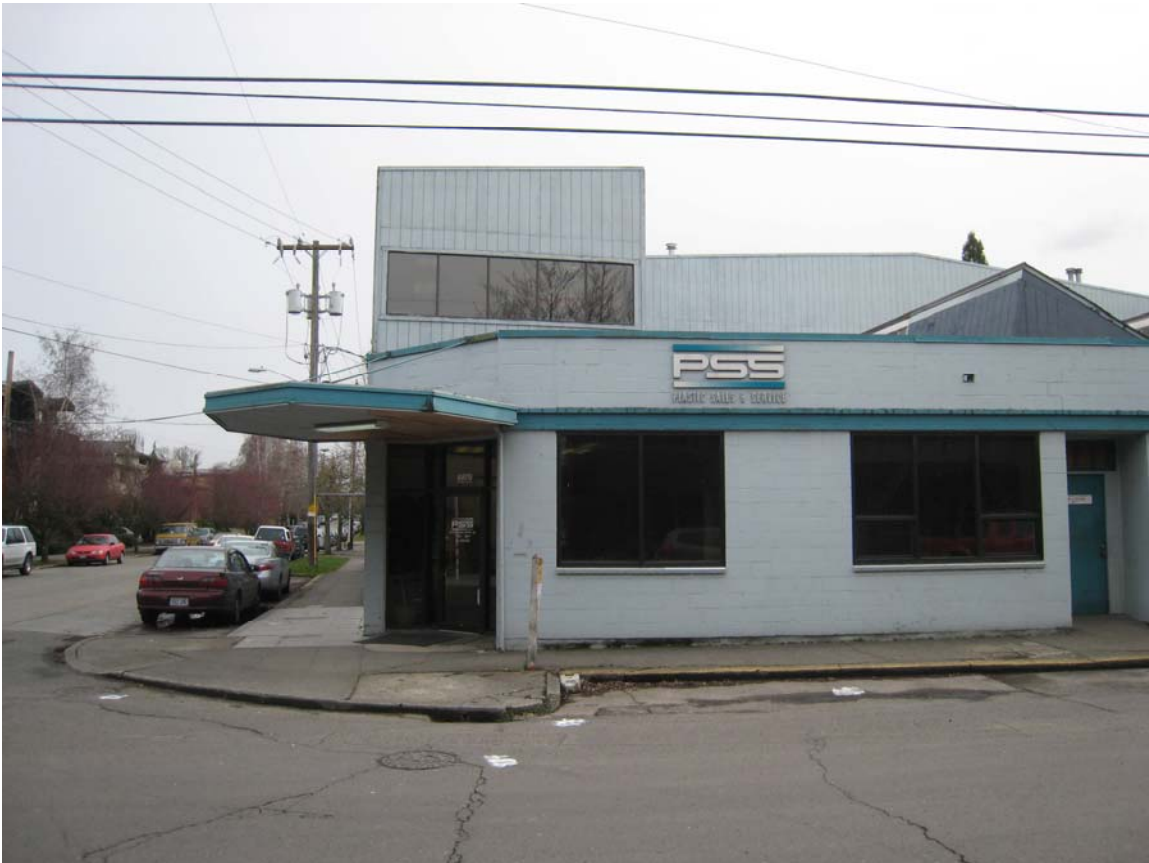
Plastic Sales & Service Inc Site, located at 6860 and 6870 Woodlawn Avenue Northeast, Seattle, Washington

Prepared by Washington State Department of Ecology 3190 160th Avenue SE Bellevue, WA 98008-5452