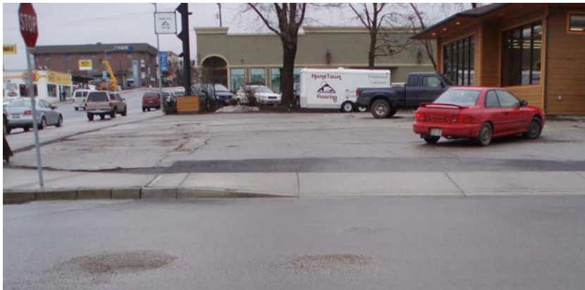
Former Whitty's Minimart Location

Ecology has taken several steps at the site to cleanup soil, groundwater, and surface water contamination. Air quality issues resulting from gasoline vapors were also addressed at the site. Cleanup criterion has been met over an extended period of cleanup actions and monitoring since 1984. Ecology now proposes removing the site from the Hazardous Sites List.