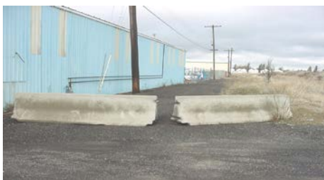
Alleyway East of Former Building

PCB contamination was found inside the building in dry wells, on building materials, in an underground storage tank, and in drain lines. Studies showed the groundwater was not impacted, but there was extensive contamination in soil from 0 to 12 inches below the ground surface. Contaminated soil was located in the gravel parking area on the north side of the building and in the alleyway east of the property