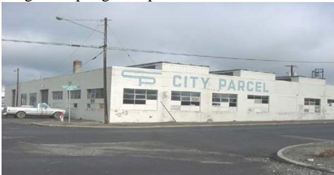
Former City Parcel Building at the corner of Cook Street and Springfield Avenue

Access to the property north of the City Parcel site has been obtained and Ecology will begin sampling after public comment has been considered.