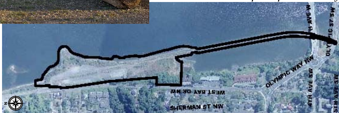
Proposed park boundary