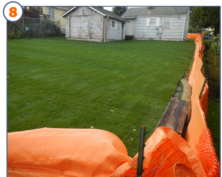
8 The contractor maintains the new lawn for the first 60 days. They may leave fences in place during this time. After this, lawn and landscape care is up to you.

Questions? For more information, please call the project line at (360) 407-7688, press 2.