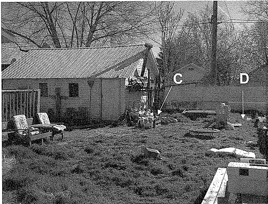
Figure 1. Top photo taken of southwest corner of the house at 428 N. Hartford Street where a fire extinguisher was found in 2004. Bottom photo shows detached garage where meth was produced. Labels "A-D" show approximate locations where soil samples were taken for site hazard assessment on April 7, 2009.