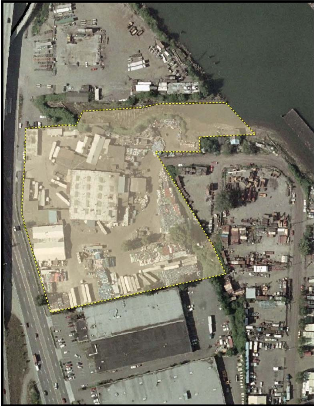
Industrial Container Services WA LLC