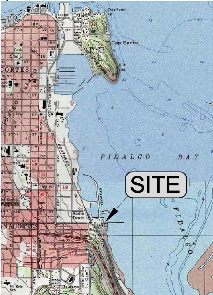
Figure 1: The Custom Plywood Mill Site is shown in the above map, located at 35 th Street and V Avenue, in Anacortes, WA.

The Custom Plywood Mill Site is located at 35 th Street and V Avenue in Anacortes, Skagit County, Washington (see Figure 1). The northern portion of the Site is currently used for temporary boat storage, and the southern portion of the site is vacant, with several freshwater wetlands in the upland area and one estuarine wetland. The Site is bounded on the east by Fidalgo Bay, on the west and southwest by the Tommy Thompson hiking trail, on the north and south by undeveloped land, and on the northwest by V Place Road.