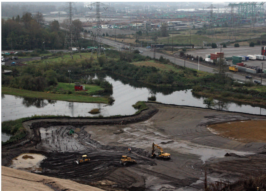
Parcel 88 habitat restoration project For more information, visit: http://www.portoftacoma.com/hylebos-creek

From the 1950's to 2006, the Parcel was a gravel and sand mine and solid waste recycling facility. Former owners brought in soil, concrete, asphalt, and metal waste as fill. A 2005 investigation found that soil and groundwater was contaminated with petroleum