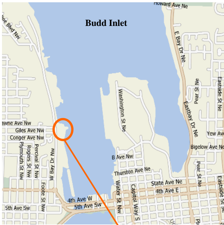
Figure 1. Solid Wood Inc. (proposed West Bay Park) site location.