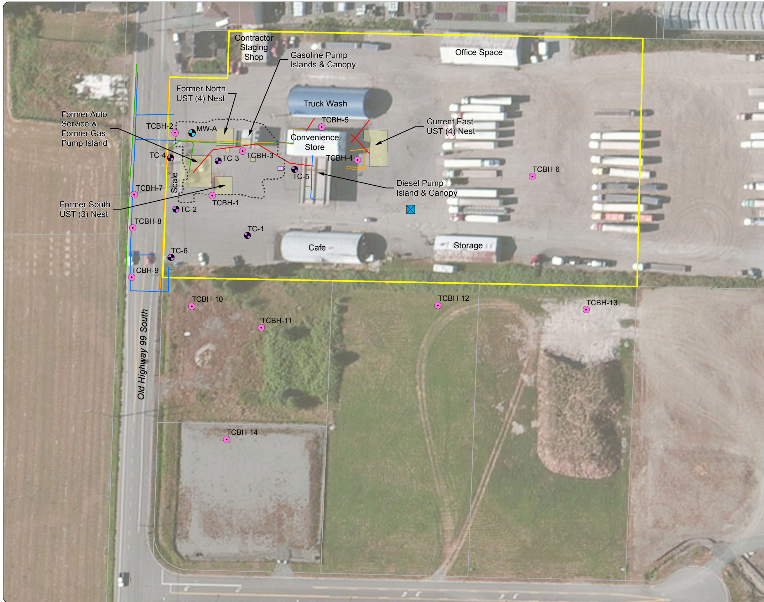
Figure 4 Site Features and Locations of Investigations

Truck City Site Mount Vernon, Washington