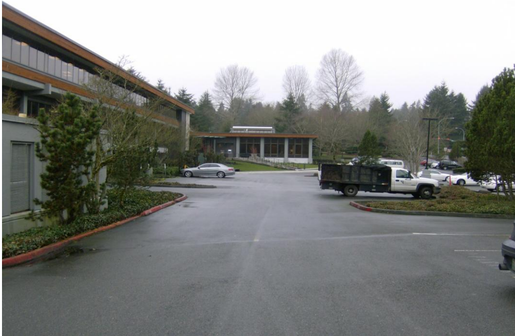
Photo 2: 1309 114 th SE – Property Manager's office in Suite 200 (typical of all bldgs)