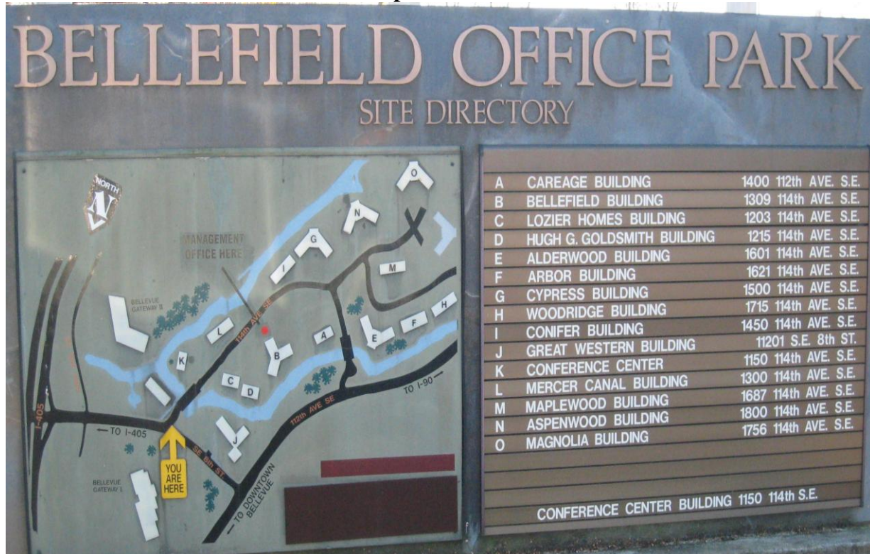
Photo 4: Close-up of building list w/ addresses (Bldgs N and O under separate review)