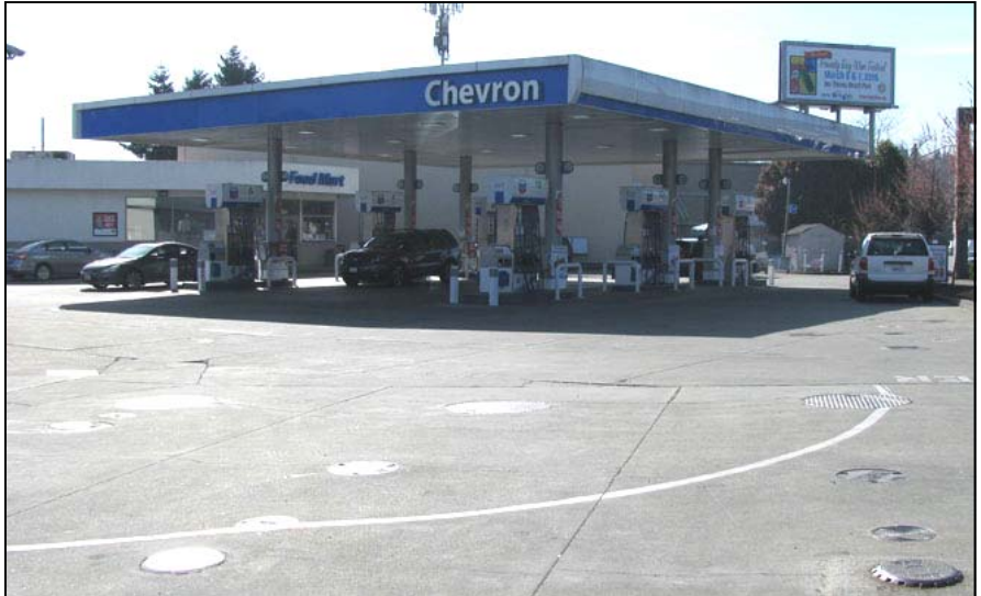
Boeing Field Chevron Site

The FS presents the results of the RI and evaluates cleanup alternatives. Once completed, the draft RI and FS reports will be made available for public comment before they are finalized.