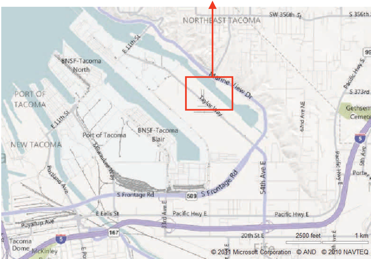
Arkema Inc. site, 2901 Taylor Way, Tacoma WA