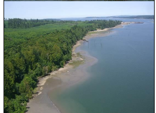
Cleanup will occur throughout the Port Gamble Bay and Mill Site.