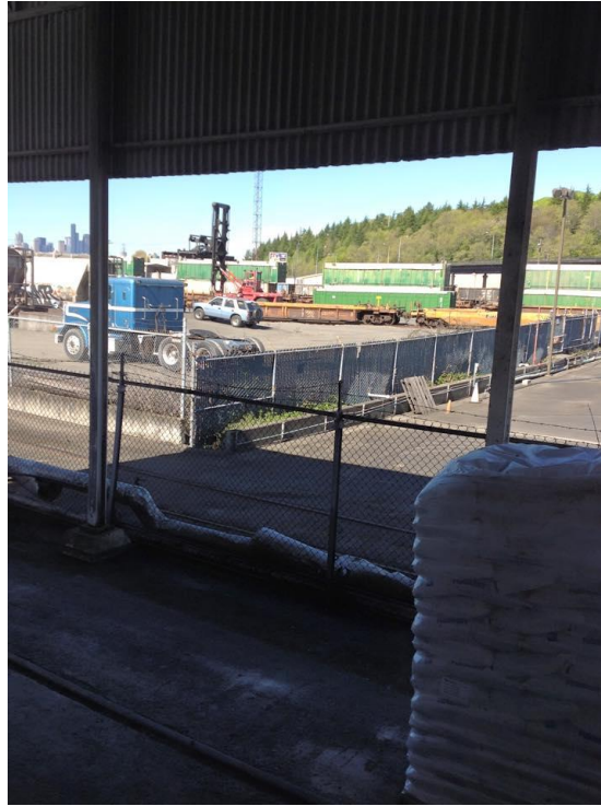
Photo 10: looking northwest from area west of PSC's North Field (on 5400 Denver property) towards Argo Yard and Aronson property