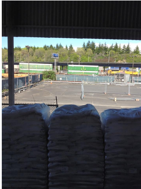
Photo 12: looking east from the 5400 Denver property towards PSC’s facility property and Argo Yard