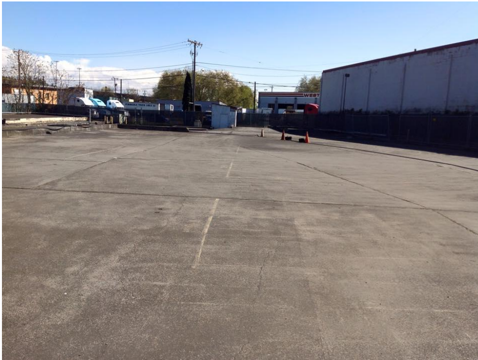
Photo 16: PSC facility property, looking east-southeast (Argo Yard maintenance building in right background)