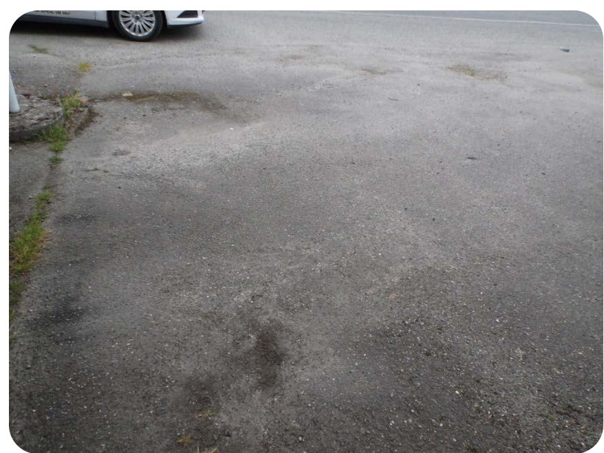
Location of former tanks