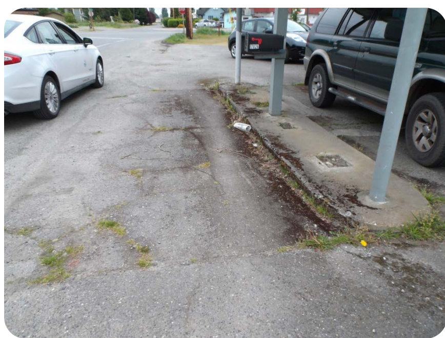
Site from southwest Location of former tanks