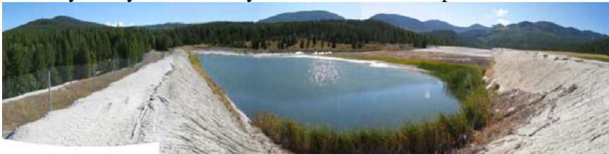
View of the east impoundment on the Lower Tailings Pile

Ecology plans to use a contractor to conduct the Remedial Investigation and Feasibility Study. You may see people at the site conducting investigations and sampling in late summer. The purpose of the Remedial Investigation is to gather more information to clearly define the contaminants and where they are located. The purpose of the Feasibility Study is to identify and evaluate cleanup alternatives.