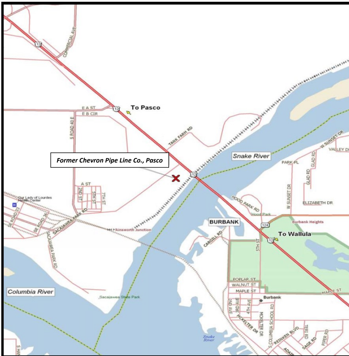
Figure 1. Former Chevron Pipe Line Company Pasco Bulk Terminal Site.