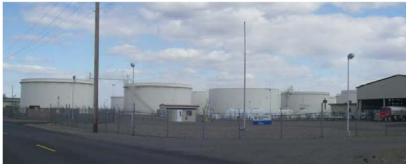
Former Chevron Pipe Line Company Pasco Bulk Terminal Site

The former Chevron Pipe Line Company Pasco Bulk Terminal Site is located at 2900 Sacajawea Park Road in Pasco, Franklin County, Washington (Page 3, Figure 1). Ecology believes the actions required by this Order are in the public's interest.