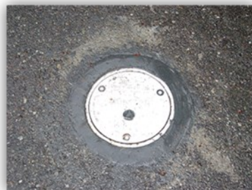
Monitoring well cover

Landau will place an 8-inch diameter cover (see photo) over each. The excess soil will be removed from the drilling site.