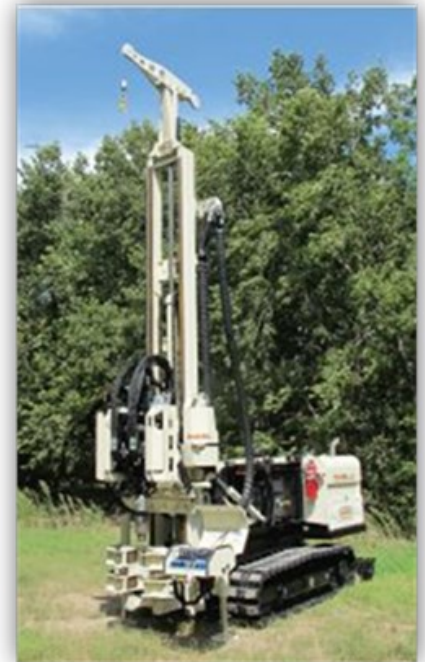
The drill rig is a large machine with many moving parts. Warning signs will be posted in the vicinity of the work area. We ask that everyone, especially children and pets, stay at least 25 feet from the work area.