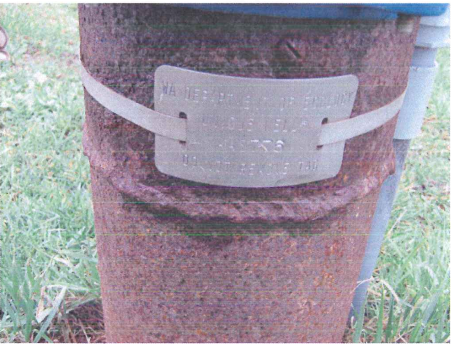
Shooting Date/Time : 1/25/2011 11:30:06 AM