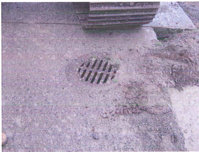
Shooting Date/Time : 1/25/2011 12:10:52 PM