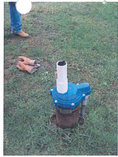
Shooting Date/Time : 1/25/2011 11:30:00 AM