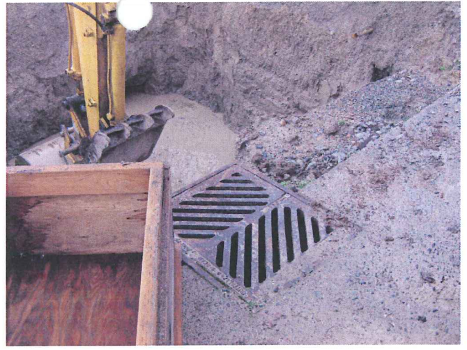
Shooting Date/Time : 1/25/2011 12:10:38 PM