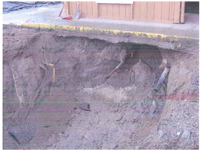
Shooting Date/Time : 1/25/2011 11:48:34 AM