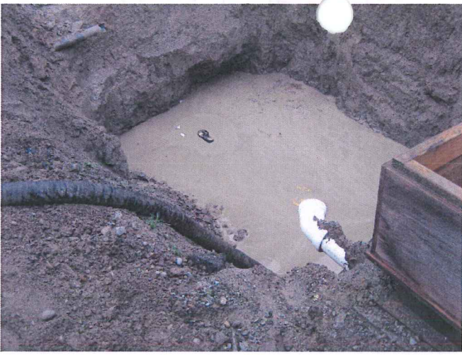
Shooting Date/Time : 1/25/2011 11:19:58 AM