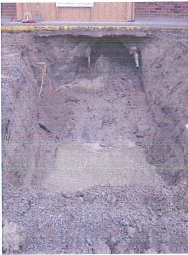
Shooting Date/Time : 1/25/2011 11:15:31 AM