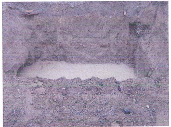
Shooting Date/Time : 1/25/2011 11:16:05 AM