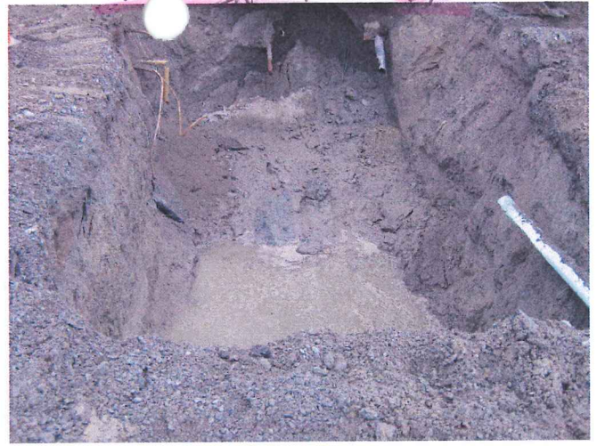
Shooting Date/Time : 1/25/2011 11:15:24 AM