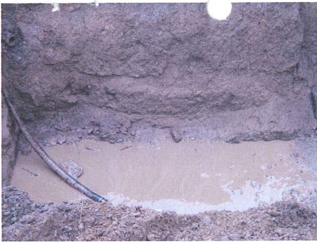
Shooting Date/Time : 1/25/2011 11:48:40 AM