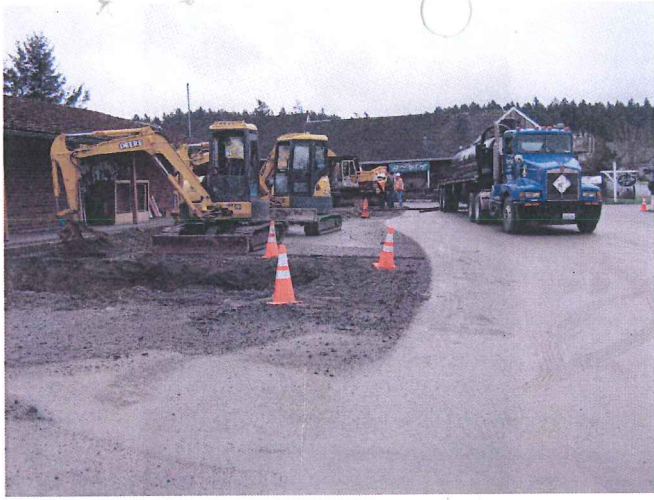
Shooting Date/Time : 1/25/2011 11:15:07 AM