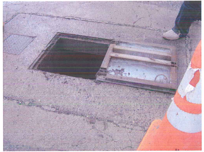
Shooting Date/Time : 1/25/2011 12:11:23 PM