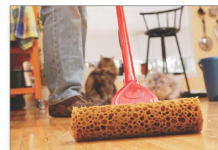
Damp dust and mop often.