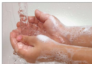
Wash your hands after playing or working outside.