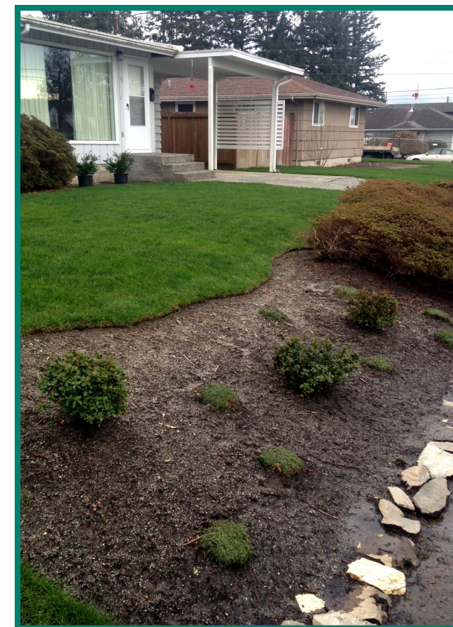
Newly restored residential properties in the 2015 cleanup group.

Thanks to all who participated in the public comment period for the Lowlands Area Environmental Reports in October-November 2015. We reviewed your feedback and finalized these reports. The next opportunity to get involved will be a comment period for the Draft Cleanup Action Plan, scheduled for this summer. Stay tuned!