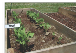
Plant flowers and plants in raised beds.

If you need this publication in an alternative format call reception at 425-649-7000. Persons with hearing loss, call 711 for Washington Relay Service. Persons with a speech disability, call 877-833-6341.