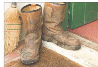
Leave your dirty shoes at the door.