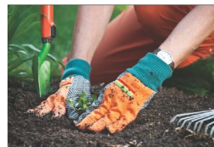
Wear gloves for yard work.

If you live in the cleanup area, we recommend you take these precautions to protect your family from contaminated soil: