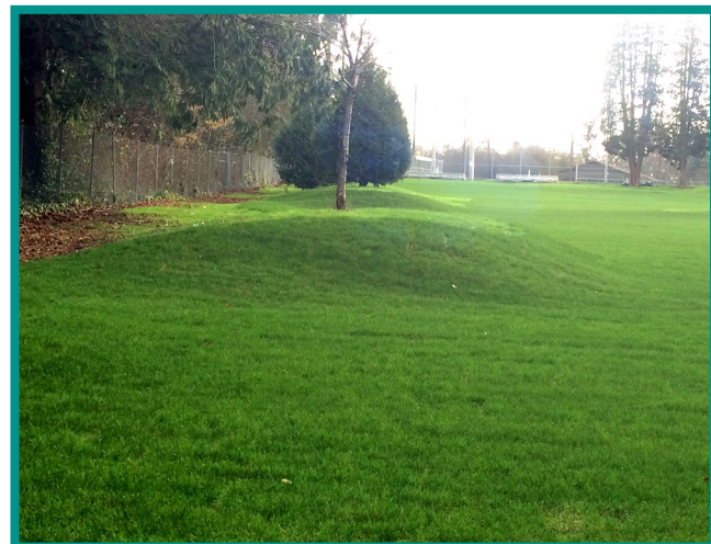
Ecology removed contaminated soils from American Legion Memorial Park, replaced it with clean soil, and restored grass and plants.