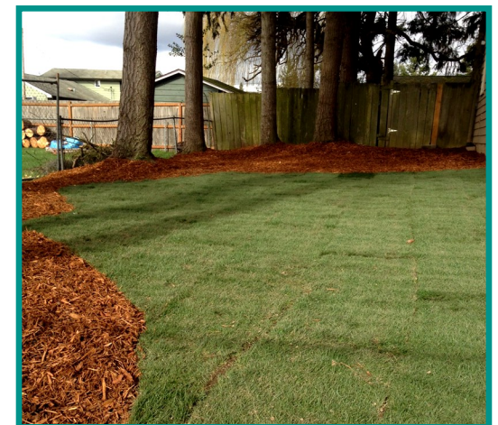
Ecology has been working to remove arsenic-contaminated soil in North Everett since 1999.