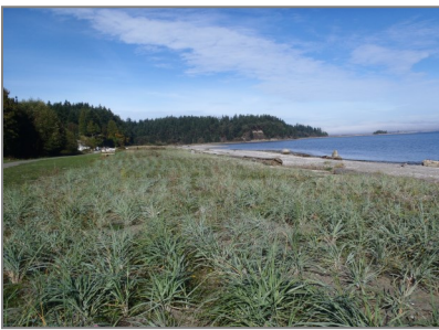
New plants in the shoreline restoration

Ecology first investigated the site in 2001 and decided that the contaminants did not pose a threat to human health or the environment. A second investigation began in 2005 after a resident found an oily residue on the beach. That investigation ultimately led to cleanup.