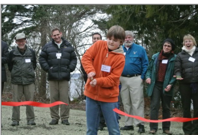
Ribbon cutting at Irondale Beach Park reopening in 2013

Ecology worked with tribes and state and federal agencies to identify and protect structures of historical significance. A plan is now in place to protect these historical features for the long term.