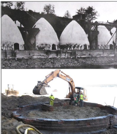
Preserving historical structures

Habitat restoration was an important part of cleanup at the Irondale site. Plants that were damaged or removed during excavation were restored and invasive plants were removed to provide better habitat for fish and other animals. Large logs and tree roots now sit at the high water mark to protect against erosion. New intertidal habitat was also created for fish.