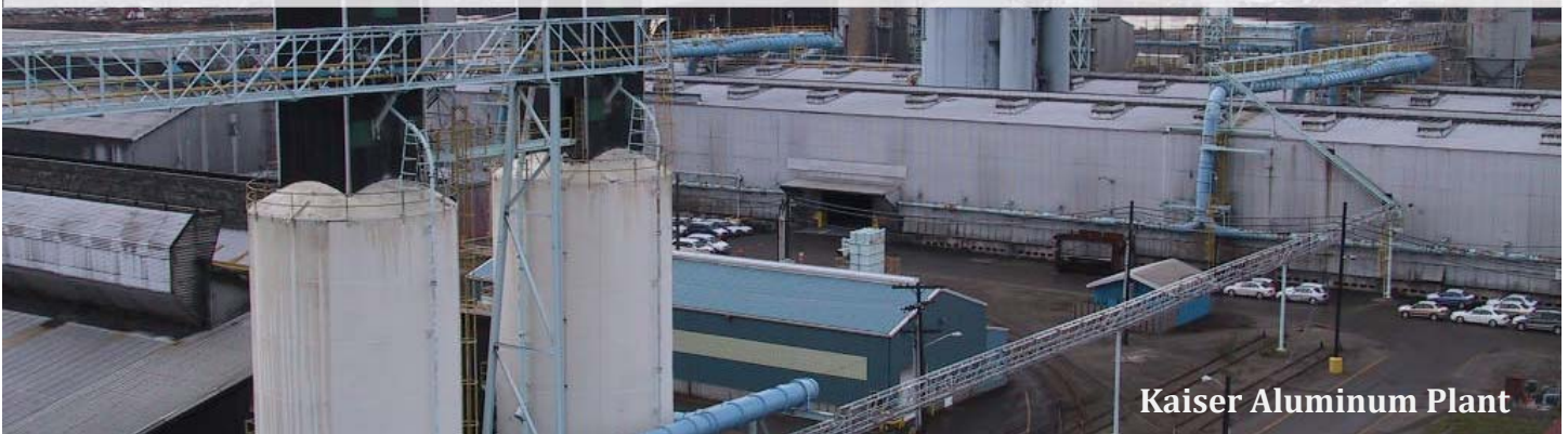
Kaiser Aluminum Plant