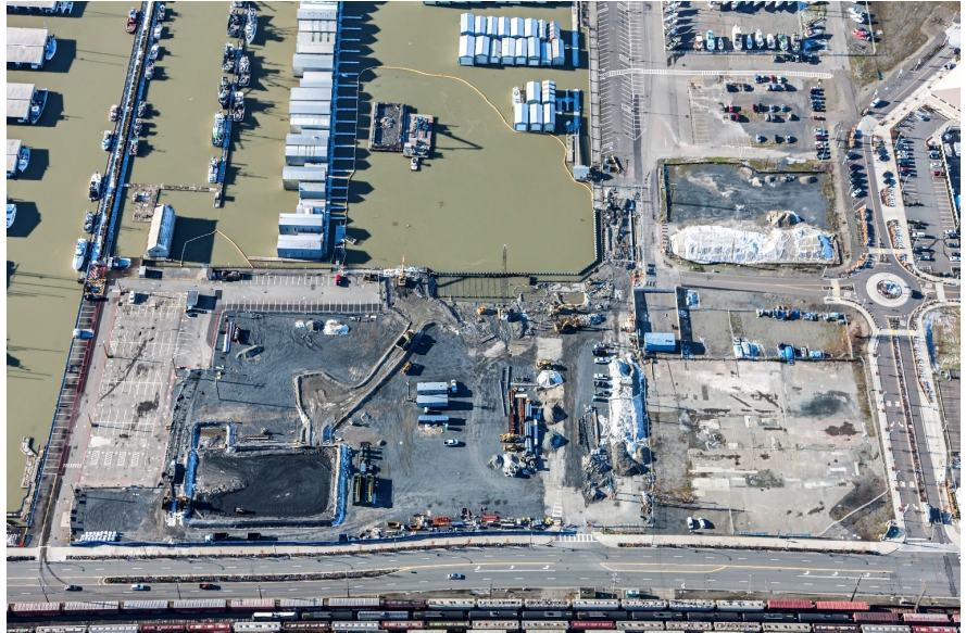
In-water cleanup at the Site in 2014.

Performing these tasks is a requirement of environmental covenants and long-term monitoring. Ecology is issuing a draft Amendment to the CD and draft Amendment to the CAP to reflect the new information and their decision.