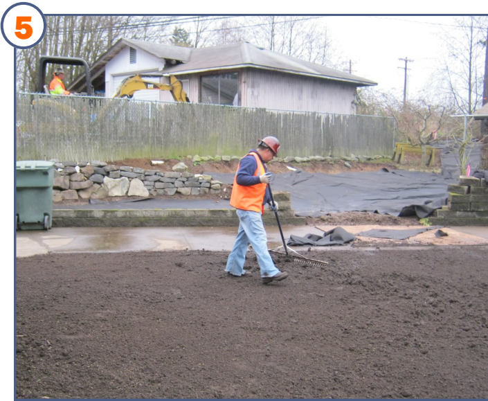
5 They spread the soil and level it to the pre-existing grade.