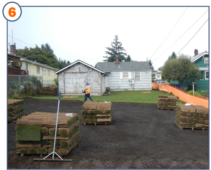
6 They deliver sod or other landscape materials to your yard.