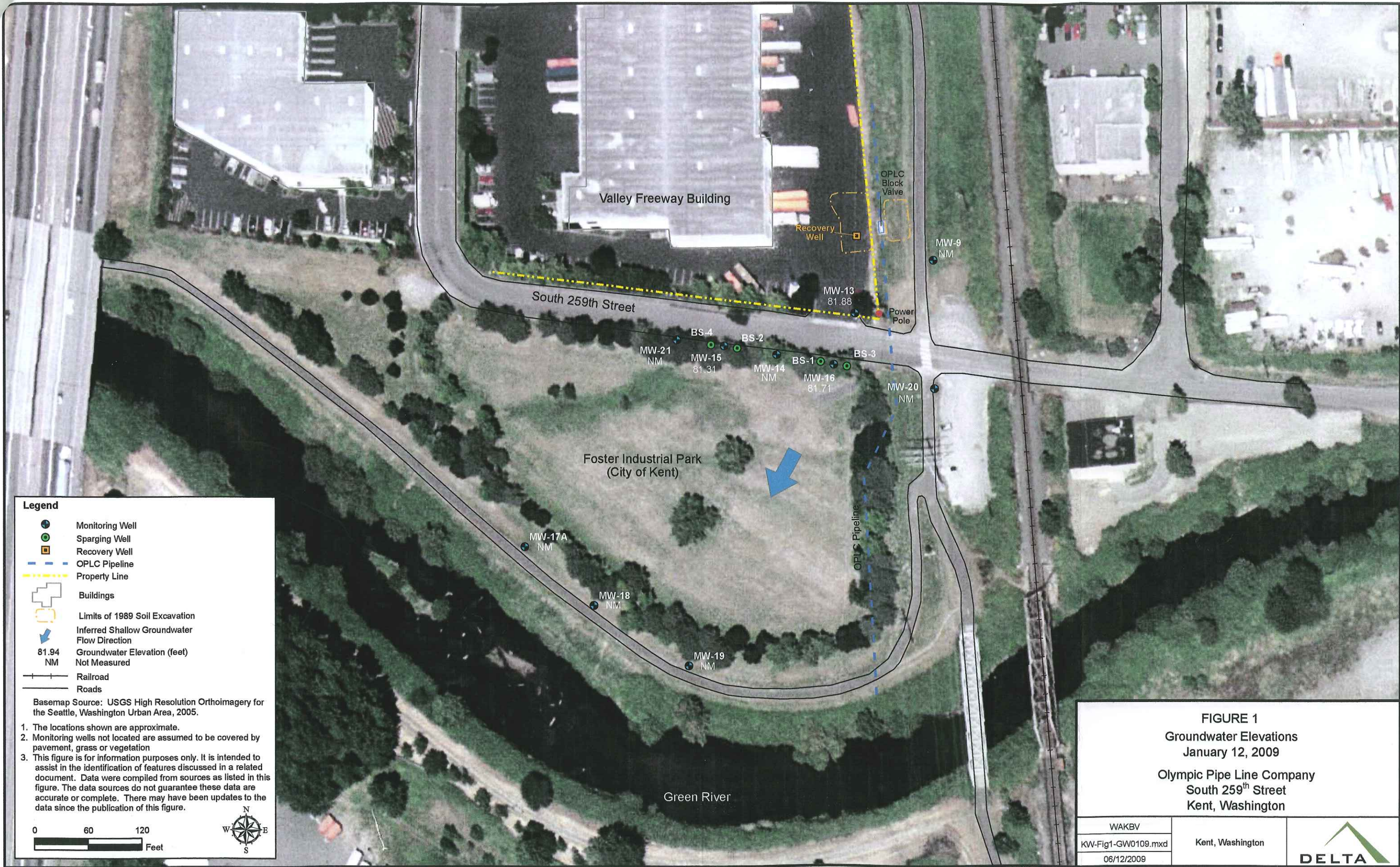
FIGURE 1 Groundwater Elevations January 12, 2009 Olympic Pipe Line Company South 259 th Street Kent, Washington