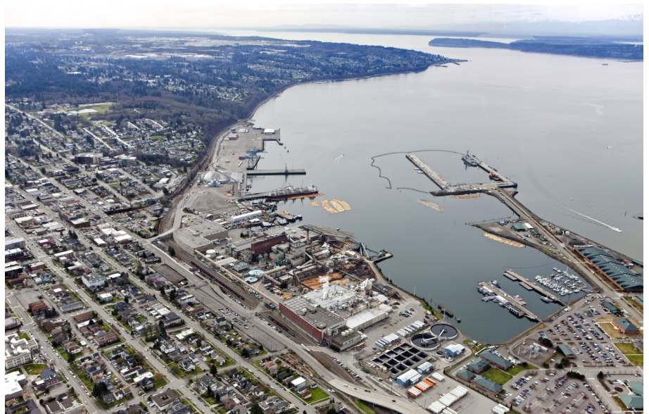
Figure 1. East Waterway Site in 2012

For information about other Ecology public comment periods, meetings, and other events, please visit Ecology's public events calendar at: https://fortress.wa.gov/ecy/publiccalendar/